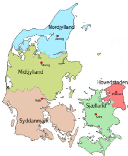
Figure 1 Supply base

Alstrup Skovservice's supply base is Danish forests, windbreaks, nature areas and urban plantations, all over Denmark, mainly in Mid-Jutland.